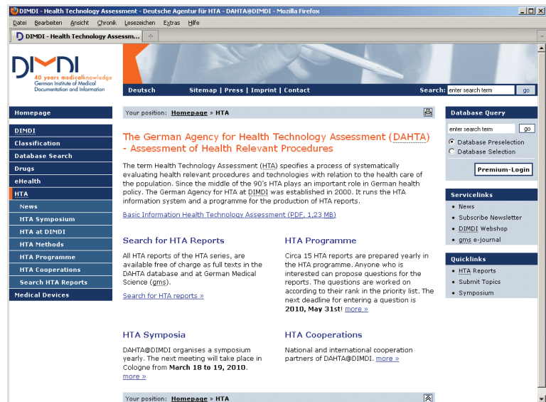
The HTA Information System at DIMDI

views of the National Health Service (NHS), Great Britain are included therein.